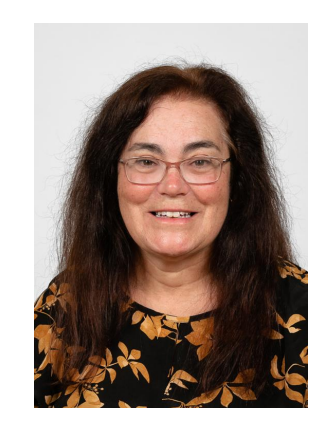
Secondary School Administrator