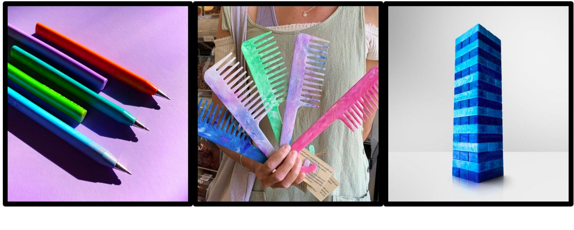
Future Manufactured Items